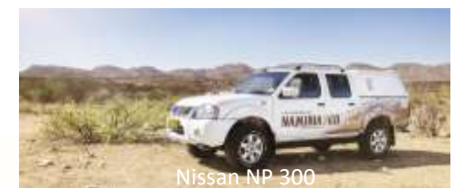
Nissan NP 300