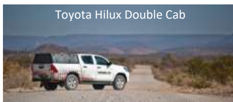
Toyota Hilux Double Cab

Rates exclude: one-way fees; additional equipment (baby/ booster seats etc); fines & fine handling fee, lost key call out fee, fuel.